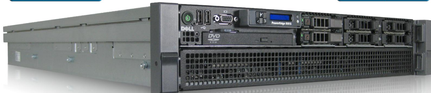
Dell PowerEdge R815 server with AMD Opteron™ processors Model 6174