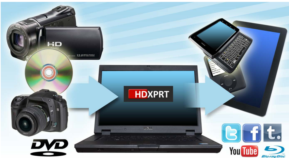
Figure 1. HDXPRT 2012 evaluates a PC's capabilities for users creating and sharing digital media content.

The five major use case categories measured by HDXPRT 2012 are the following: