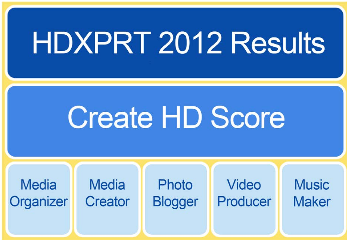
Figure 2. HDXPRT result categories.

Figure 2 shows the categories of results produced by HDXPRT 2012.