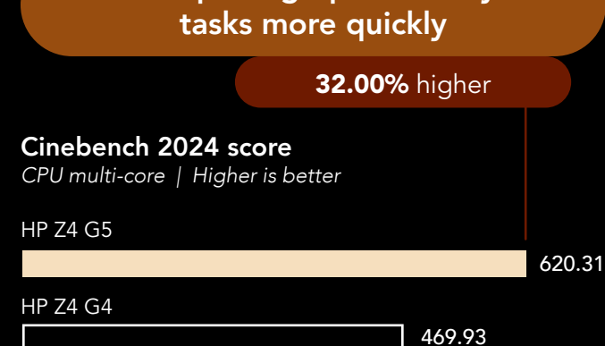
Figure 3: Cinebench 2024 CPU multi-core scores. Higher numbers are better.

It's not just AI users who stand to benefit from the processing power the HP Z4 G5 has to offer. Teams with graphicsheavy tasks, like engineers who render complex models or video creators working with animation, can rely on the HP Z4 G5 workstation with Intel Xeon w3-2425 processor to keep their work moving smoothly. Figures 3 and 4 show the results of just two of the everyday and content creation workloads we tested.