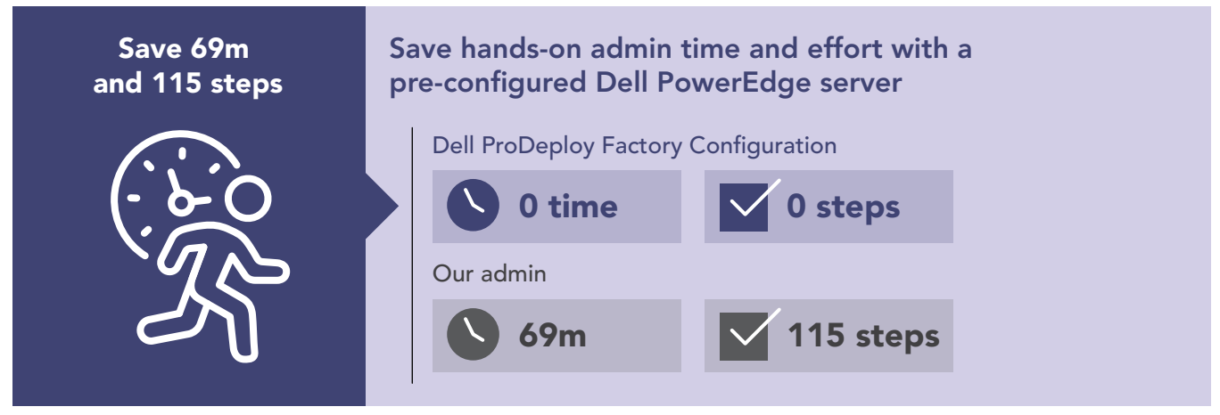
Figure 1: In-house admin time, in minutes, and steps to configure a single PowerEdge server. Lower is better.

Figure 1 shows the total time and steps to complete the configuration tasks after resetting the PowerEdge server. To see the full list of tasks, see the science behind this report . Please note, using deployment tools when configuring servers on site could cause the time savings to vary.