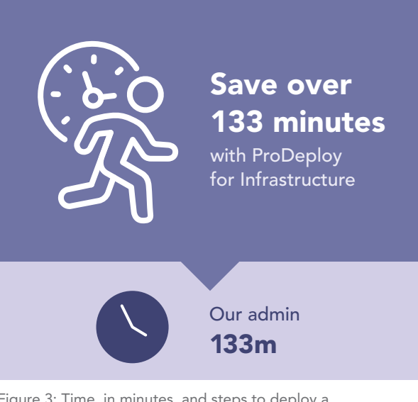
Figure 3: Time, in minutes, and steps to deploy a single PowerEdge server. Lower is better.

ProDeploy can also help with a large or multi-phase server rollout by deploying the servers for you. To show how much time an organization could save using ProDeploy for Infrastructure on a large-scale server installation, we extrapolated the captured timings from the single Dell PowerEdge R750 server deployment to 100 servers. As Figure 4 shows, allowing a Dell-certified engineer to deploy 100 PowerEdge servers for you could save over 223 hours compared to having an inhouse admin deploy them.