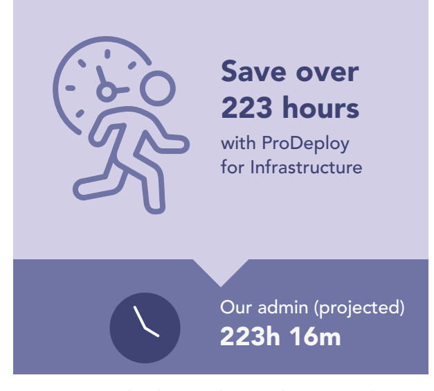
Figure 4: Extrapolated time, in hours and minutes, and steps to deploy 100 PowerEdge servers. Lower is better. Source: Principled Technologies.

Figure 3: Time, in minutes, and steps to deploy a single PowerEdge server. Lower is better. Source: Principled Technologies.