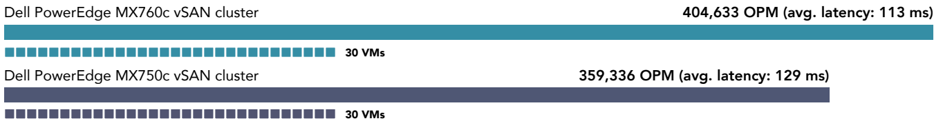
Figure 2: Total orders per minute the two clusters achieved with 30 VMs. Higher OPM and lower latency are better.

Using the data above, we can see that the new-generation PowerEdge MX760c servers consistently outperformed the PowerEdge MX750c servers on OPM while maintaining a lower application latency. When comparing the latencies to show performance at the same application response times, we see that the new-generation servers provide 25 greater density while supporting 19 percent more OPM. In Figure 3, we compare the performance of the previous-generation cluster with 24 VMs and the new-generation cluster with 30 VMs. The new-generation cluster delivered a performance advantage of 19.7 percent while delivering comparable latency, all at over 90 percent CPU utilization in both environments.