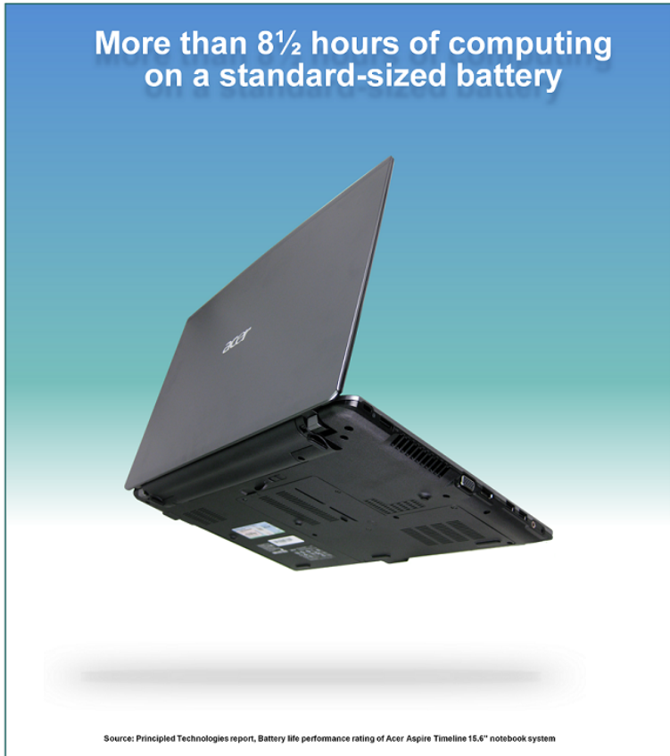
Figure 2: Alternate view of the Acer Aspire Timeline 5810TZ notebook system. The notebook case fully contains the battery.

system powers down due to low battery life. At the 7 percent battery life setting, MobileMark 2007 records a timestamp once per minute. At the end of the benchmark, it compares the beginning timestamp to the final (last recorded) timestamp. MobileMark 2007 derives its system battery life rating as the number of minutes between the start and end timestamps.